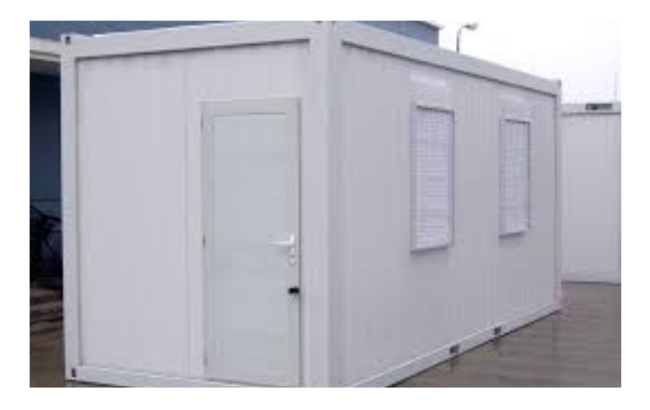
Container House Specialist