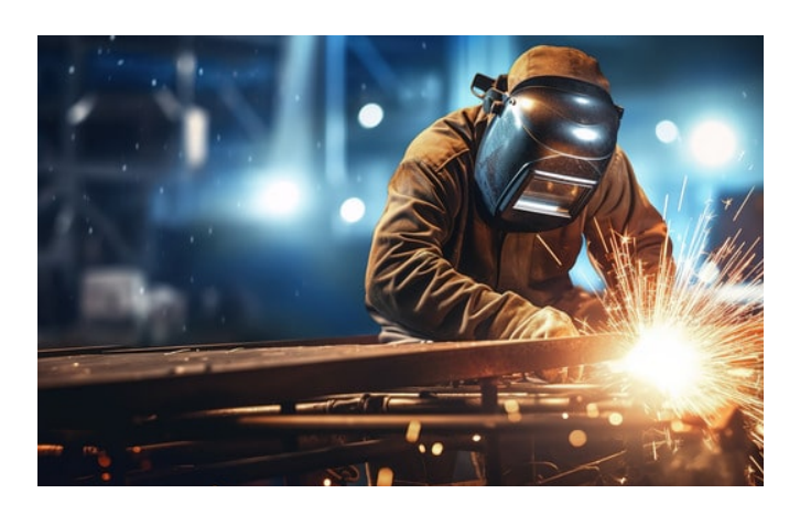
Welding Inspection Control